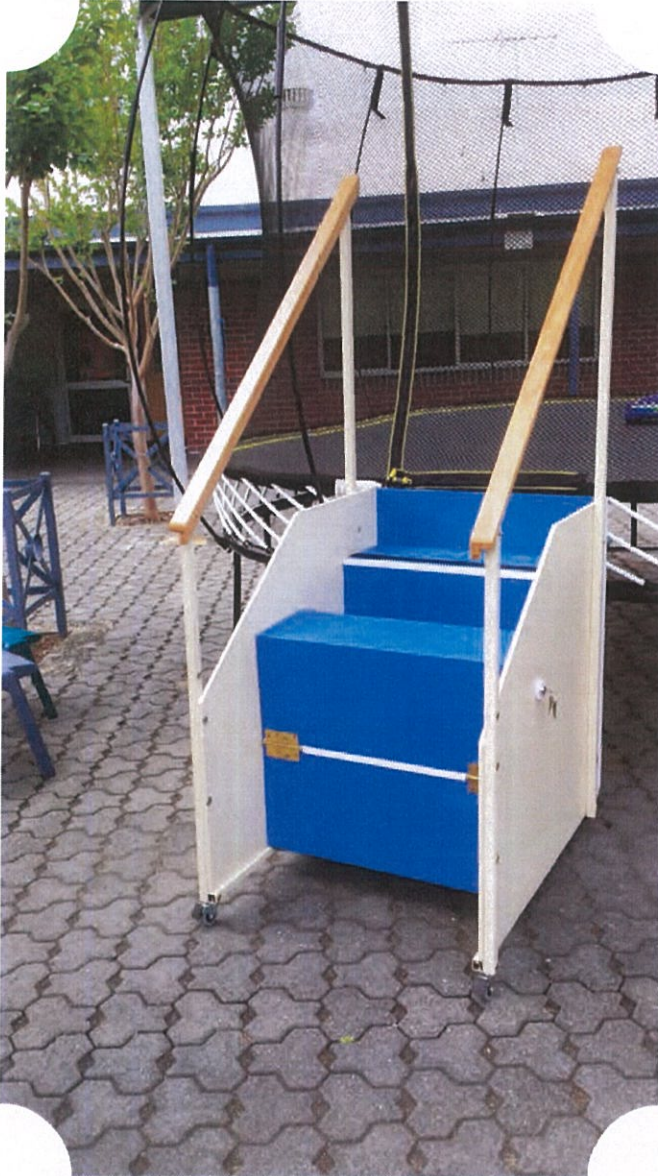
Paul's- Completed Steps (unfolded)