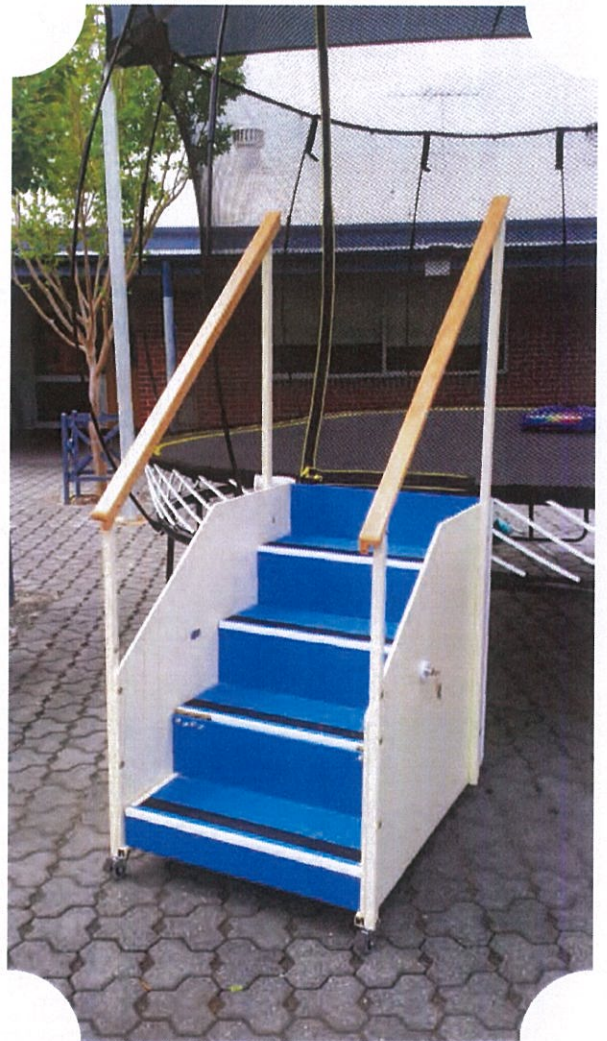
Paul's- Completed Steps (folded)